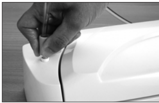
Insert Accessory Hose